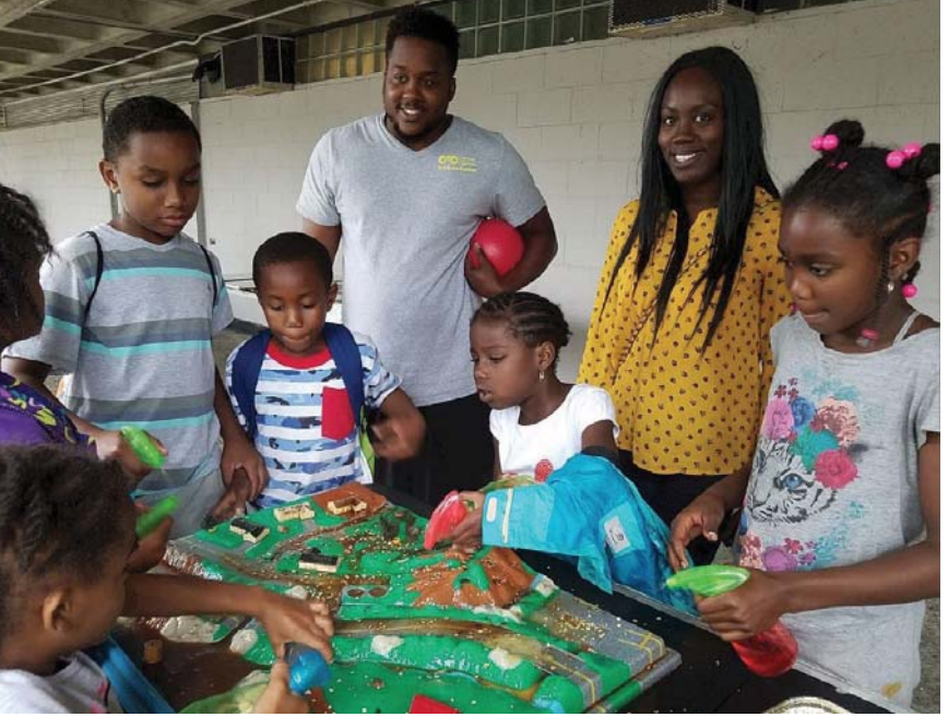
Figure 3.22 Buffalo Sewer Waterworx session using demonstration game

Signage will accompany Buffalo Sewer green infrastructure projects. These signs will be installed at the site of any new green infrastructure and provide descriptions of how the green infrastructure works and some of the installation's environmental benefits. These help residents to understand why these new landscape elements have been installed and their value to the environment.