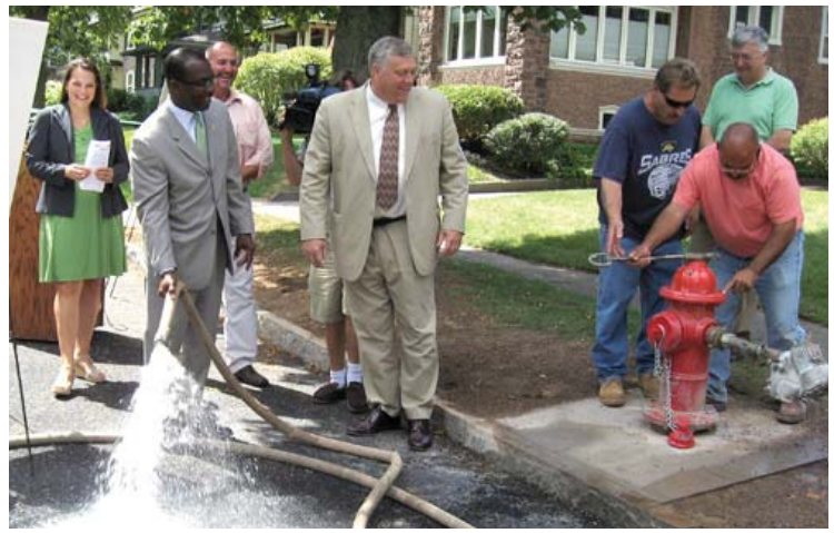
Figure 3.14: Demonstrating porous asphalt on Clarendon.