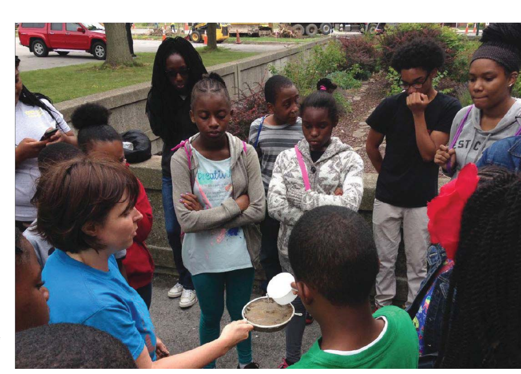
Figure 3.9: Educating the next generation of green infrastructure practitioners at Buffalo Sewer Waterworx event.

There are many owners who have a portfolio of similar properties and who could more easily implement green infrastructure across a building type or project type. These include commercial developers, such as retail property owners, as well as institutional owners who manage campuses of medical or educational buildings. They likely have significant existing land management responsibilities where green infrastructure maintenance could be absorbed.