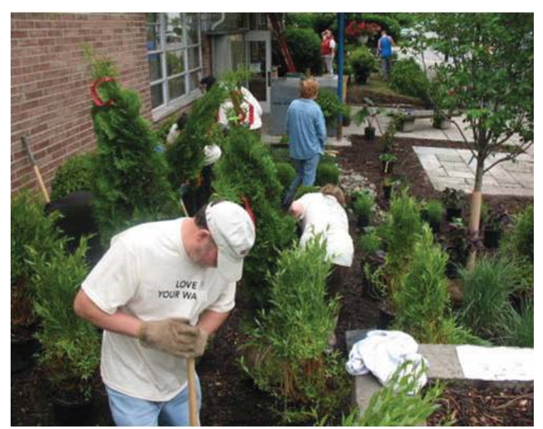
Figure 3.16: Team installing green infrastructure at the Crane Library.

Buffalo Sewer can offer technical assistance, logistical support and potentially funding to individuals and organizations interested in collaborating with Buffalo Sewer to implement green infrastructure.