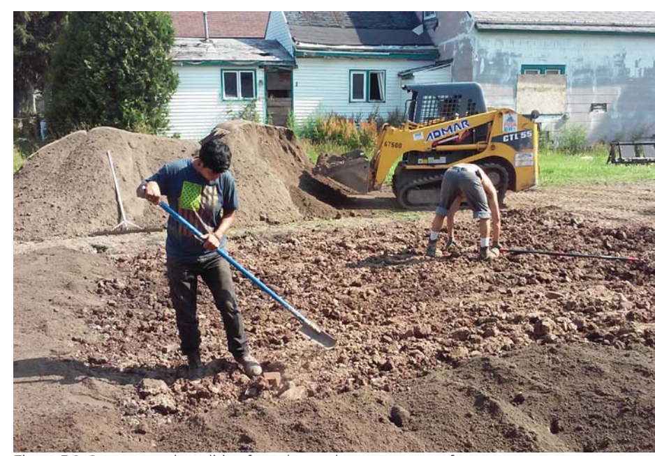
Figure 3.2: Green post-demolition for enhanced stormwater performance

Buffalo Sewer was also the first sewer utility in the country to receive credit for demolitions within their LTCP. Building on the green infrastructure projects already completed by Buffalo Sewer, this report identifies opportunities to increase the scale and scope of green infrastructure implementation in the six priority CSO basins..