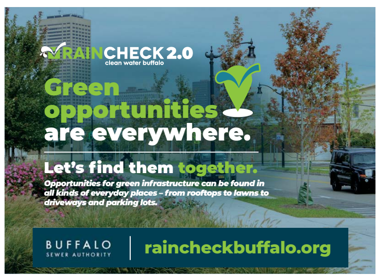
Figure 3.19:Rain Check Palm Card.