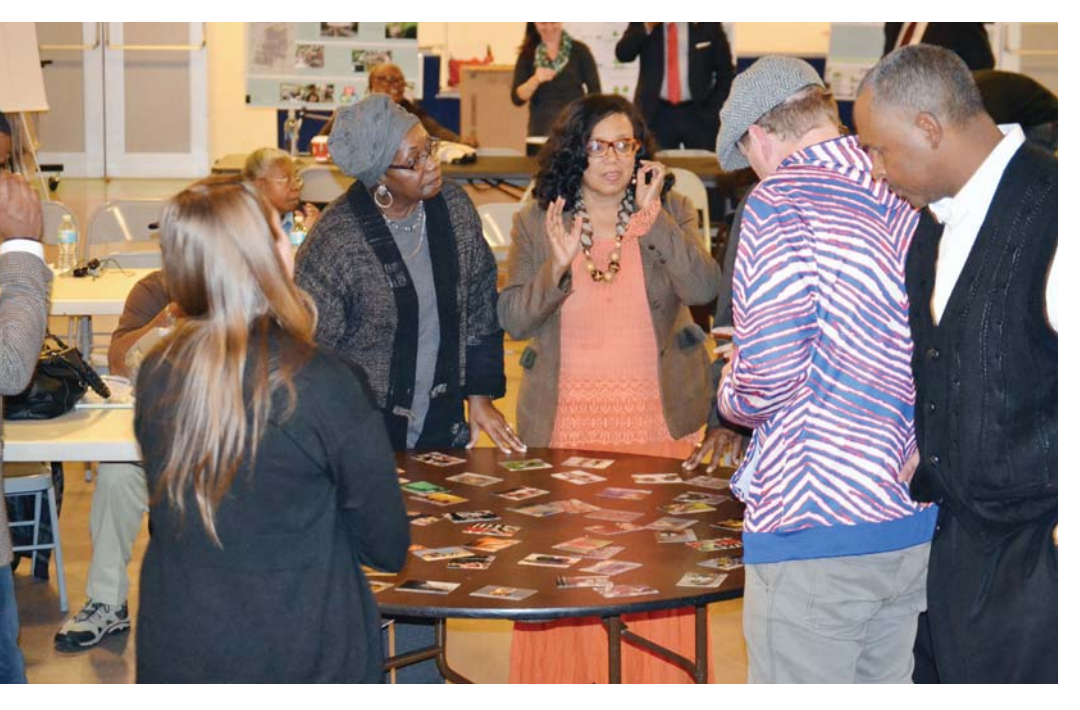
Figure 3.13: Buffalo Sewer Community Meeting.