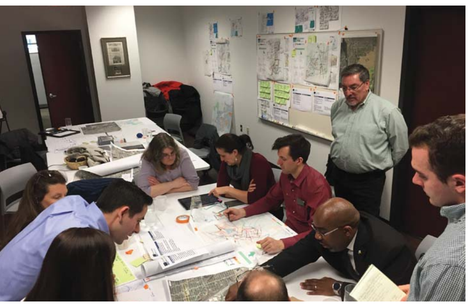
Figure 3.5: Rain Check Opportunity Meeting.