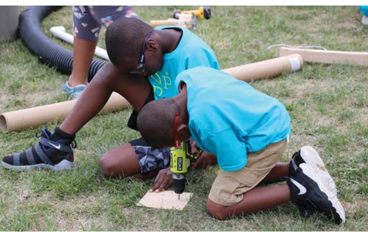
Figure 3.4: Buffalo Sewer WaterWorx Pop-Up Park.