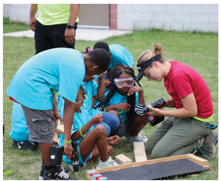
Figure 3.17: Buffalo Sewer and Community Action Organization of WNY Pop Up Park event.