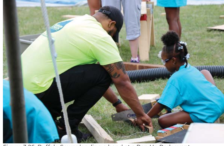
Figure 3.26: Buffalo Sewer lending a hand at a Pop Up Park event.

Listen First to the goals and aspirations of partners, stakeholders, and the community. Buffalo Sewer recognizes that engaging the community must be a conversation and is committed to listening first to the community vision. Only then can Buffalo Sewer understand how its green infrastructure work can support that community vision.