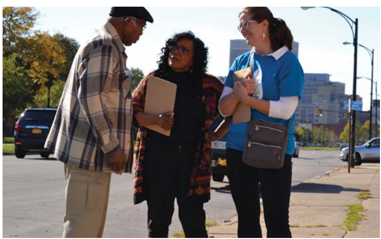
Figure 3.25: Community engagement on William Street.

Property owners play an important role in making green infrastructure a success, as they can act as stewards to maintain installations on or adjacent to their property. As Buffalo Sewer broadens its range of projects and the areas of the City where it is installing green infrastructure, it will need to continue to bring individual property owners into the process early, and