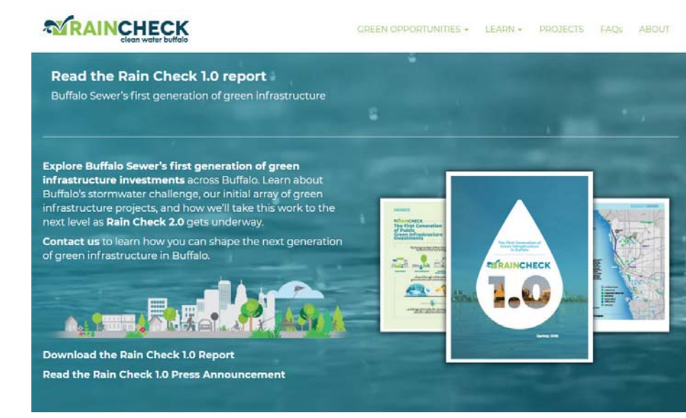
Figure 3.24: Rain Check Website Splash Page.