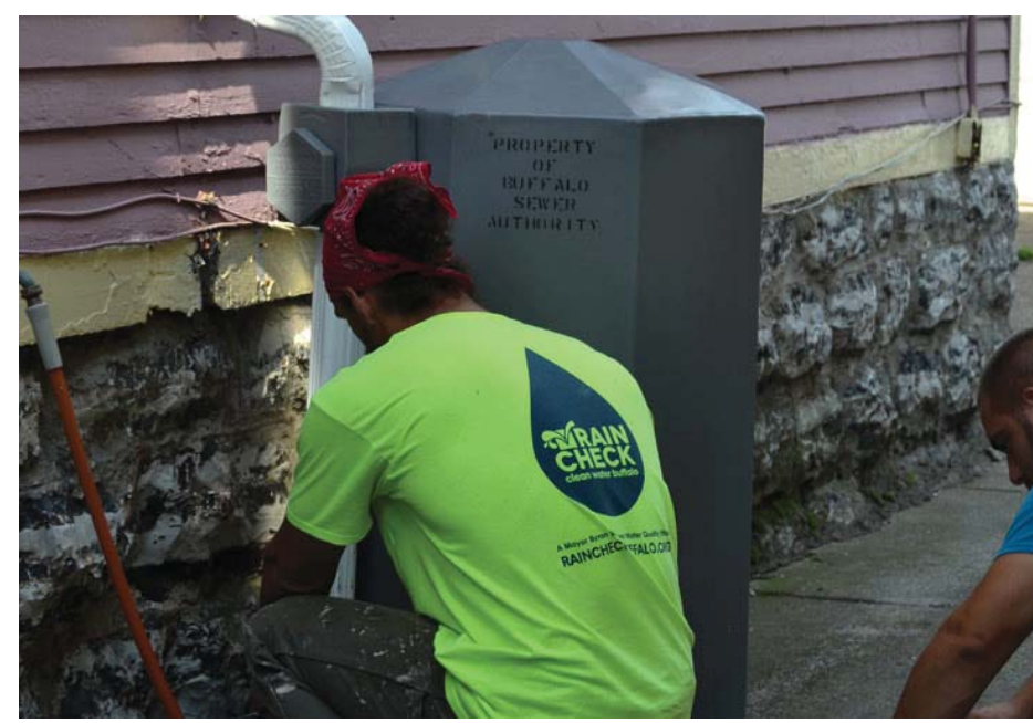
Figure 3.15: Rain Check rain barrel being installed at a residential property.