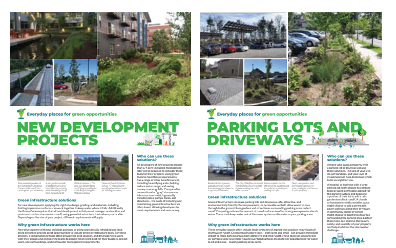
Figure 3.20: One Page Handouts.