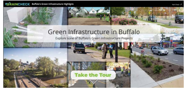
Figure 3.21: Screen Shot of the Online Tour.