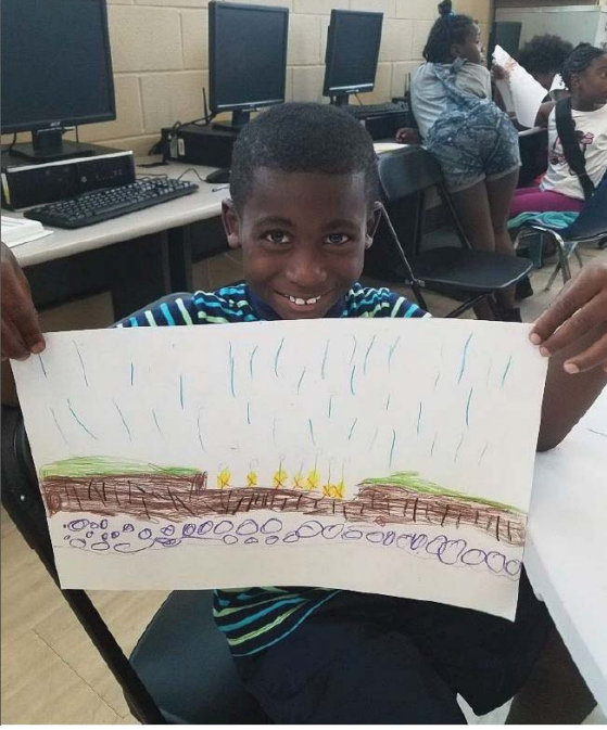
Figure 3.11: Student at Buffalo Sewer Waterworx shows off his rain garden drawing.