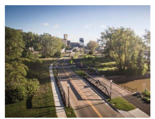
Figure 3.3: Green Street Case Study at Ohio Street.