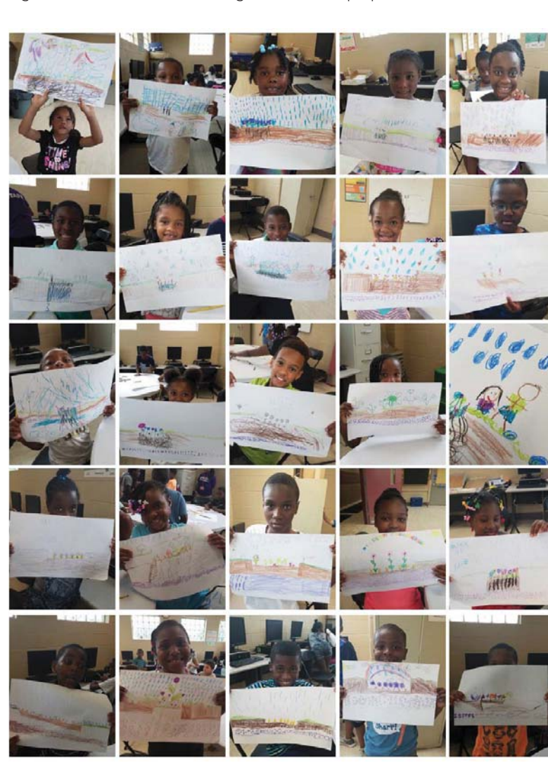
Figure 3.27: Students at Buffalo Sewer Waterworx show off their rain garden drawings.