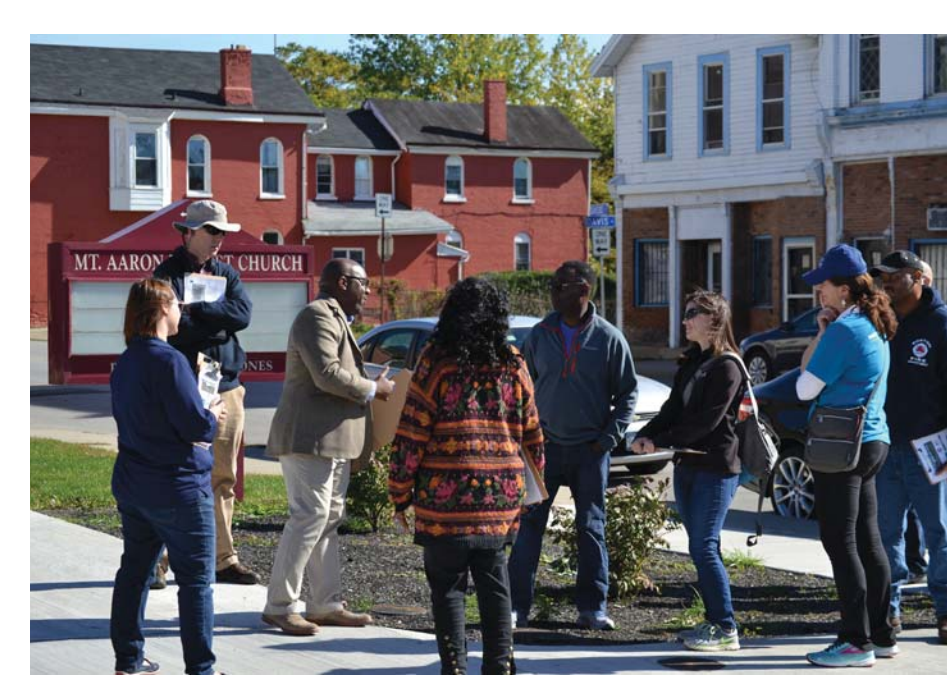
Figure 3.6: Community Visioning Walk in Buffalo.

Training Buffalo Sewer staff and seasonal workers on green infrastructure with the National Green Infrastructure Certification Program (NGICP), which provides the baselevel skill set needed to properly construct, inspect, and maintain green stormwater infrastructure.