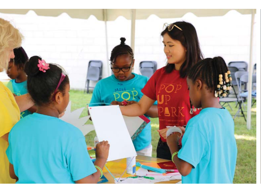
Figure 3.10: Buffalo Sewer and Community Action Organization of WNY Pop Up Park event.

Increasingly, sustainability is becoming important to market advantage in real estate. This is one of the premises behind sustainability rating systems, such as ENVISION, LEED and SITES. In certain types of industries (for example high-tech fields) a highly sustainable development is seen as conferring a market advantage. Sustainability, particularly when it is visible and attractive, can make a property more attractive to prospective tenants or buyers and command higher rents. This may also be an incentive for developers to choose to implement green infrastructure.