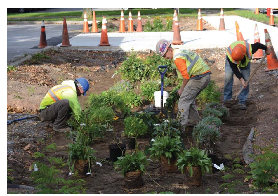
Figure 3.12: Workers installing a rain garden facility at JFK community center.

The only experienced and certified NGICP professionals in New York State are located in the City of Buffalo. Buffalo is also home to 1 of 21 NGICP trainers in the entire country. Buffalo Sewer is committed to developing the most skilled and knowledgeable individuals in the field of green infrastructure and hopes to expand the number of people in the region certified and trained in green infrastructure. Buffalo Sewer will continue partnerships with organizations that conduct workforce training, such as PUSH Buffalo and Groundwork Buffalo.